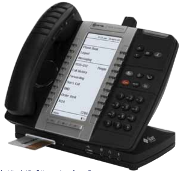
Mitel Unified IP Client for Sun Ray