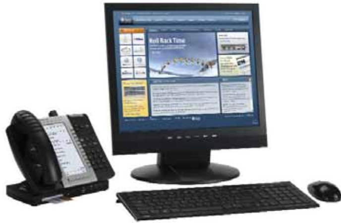
Mitel Unified IP Client for Sun Ray